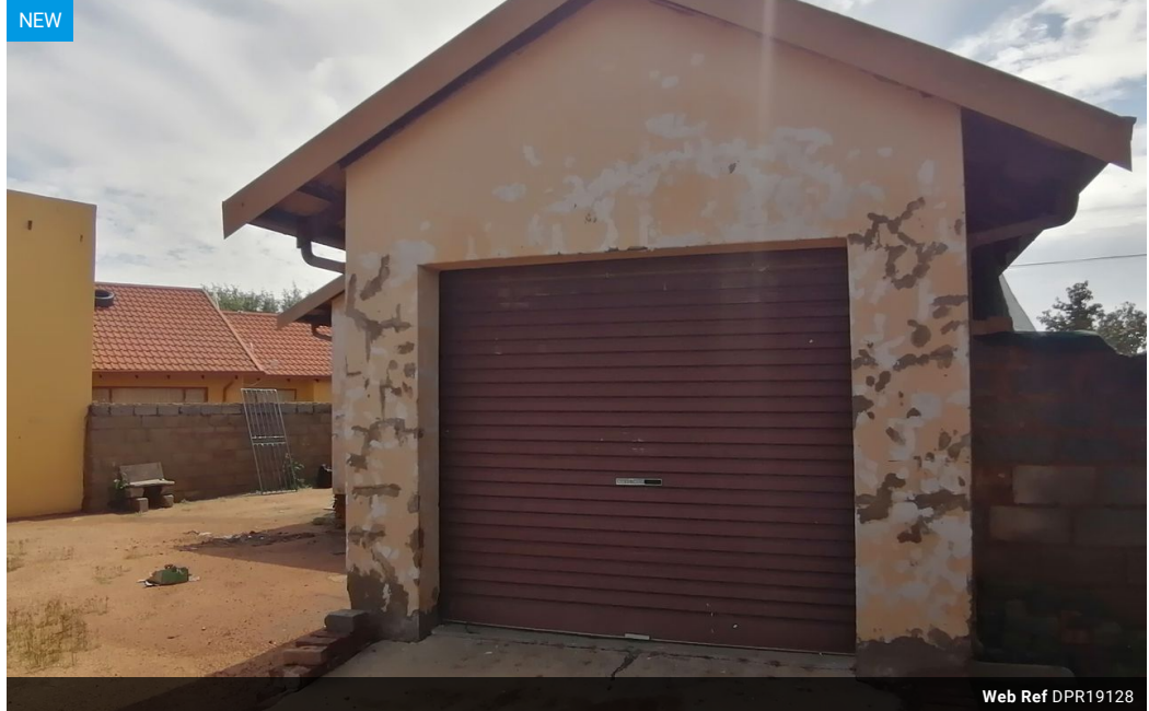
Web Ref DPR19128