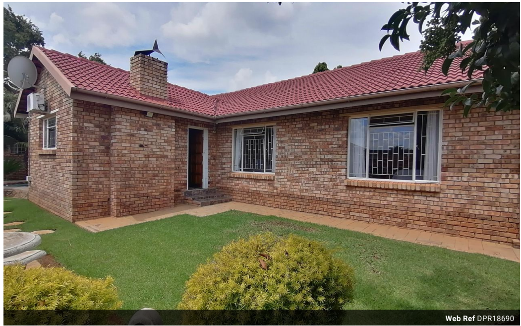
Web Ref DPR18690