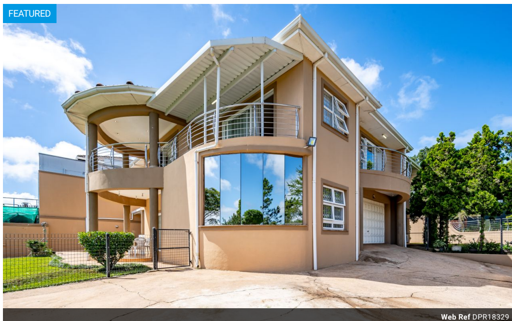
Web Ref DPR18329