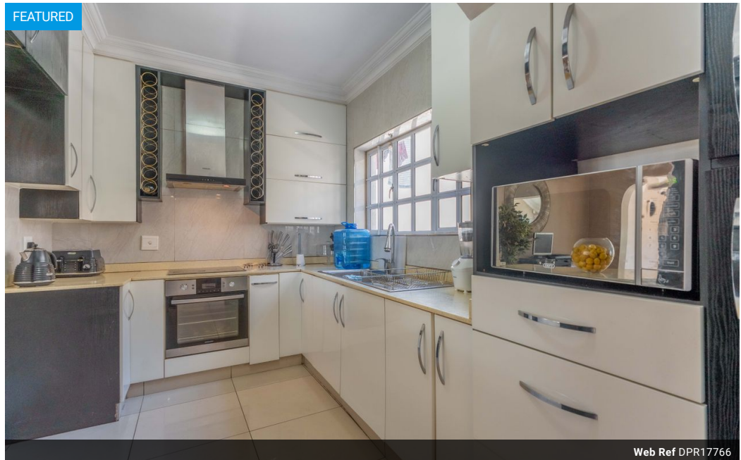
Web Ref DPR17766