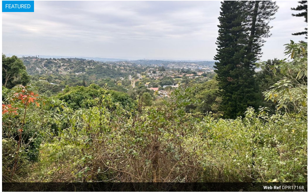
Web Ref DPR17168