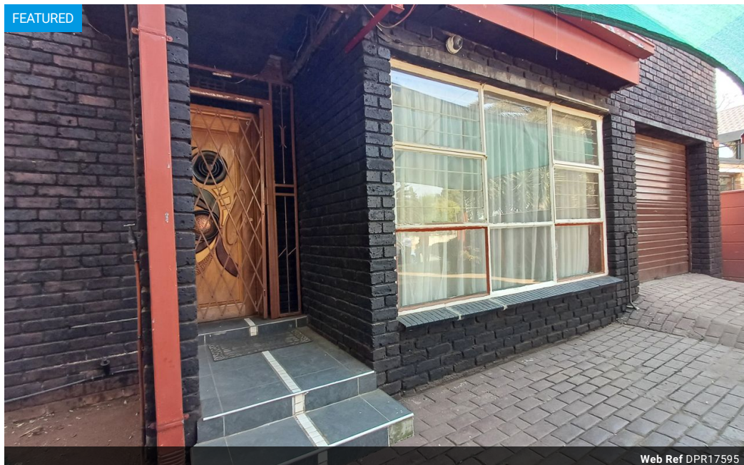
Web Ref DPR17595

Heritage Square Shopping Centre - Suite 9, Cecil Knight St, Krugersdorp North, Krugersdorp 1718