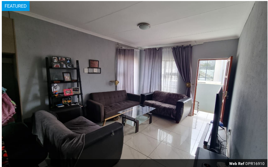
Web Ref DPR16910