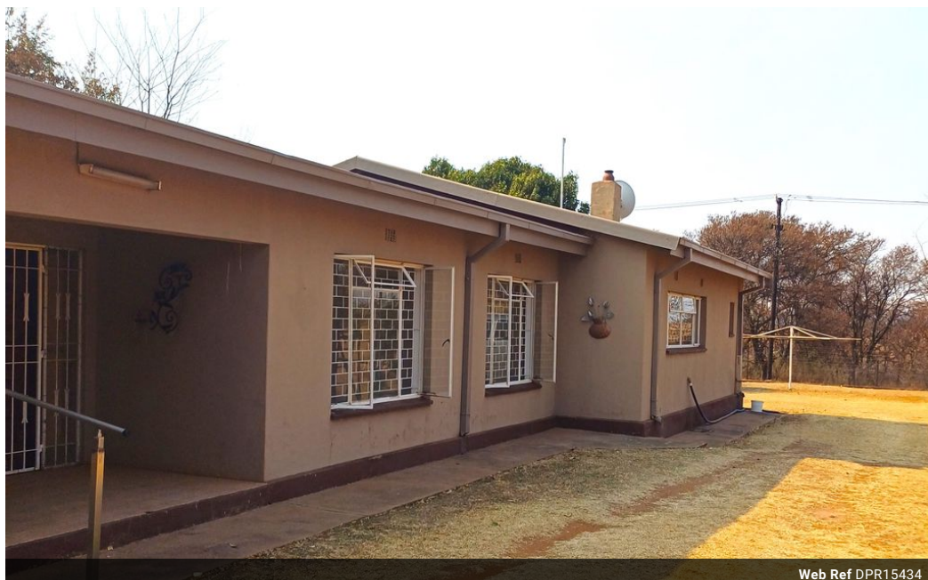
Web Ref DPR15434

24 Glynn Street Rothdene, Meyerton, 1961