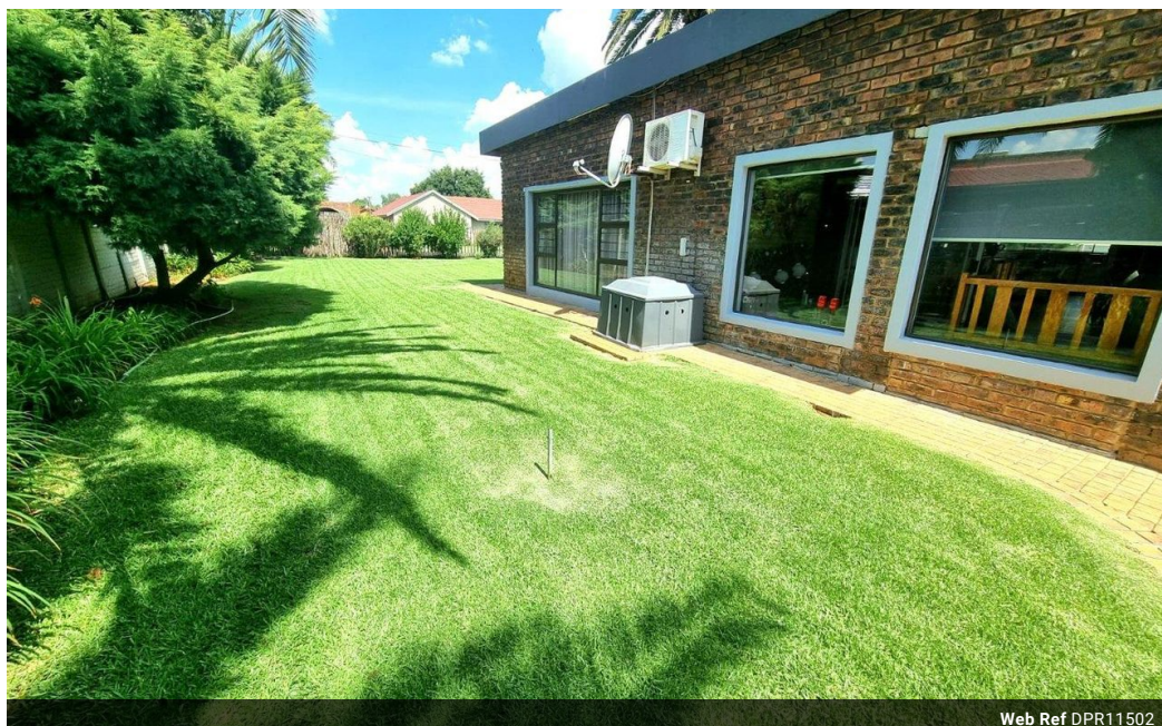
Web Ref DPR11502

24 Glynn Street Rothdene, Meyerton, 1961