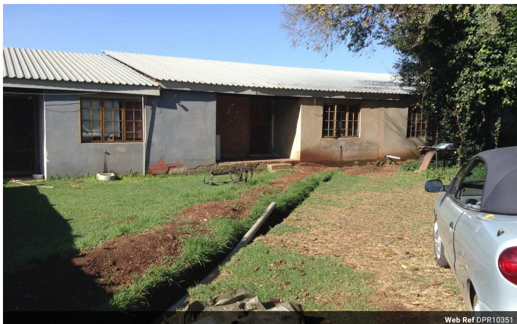
Web Ref DPR10351

24 Glynn Street Rothdene, Meyerton, 1961