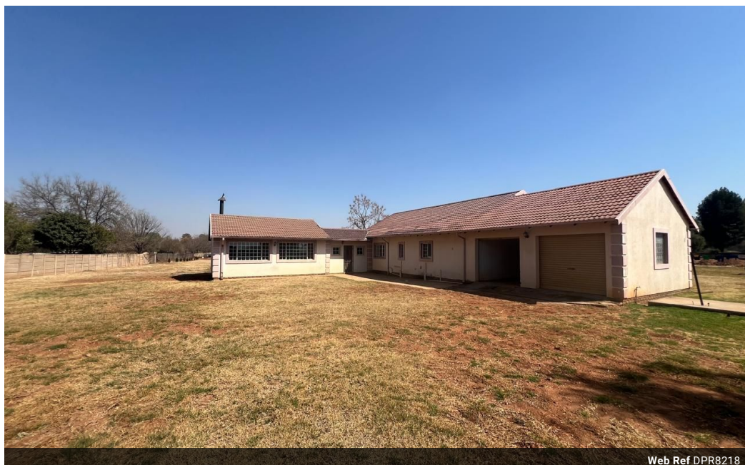
Web Ref DPR8218

24 Glynn Street Rothdene, Meyerton, 1961