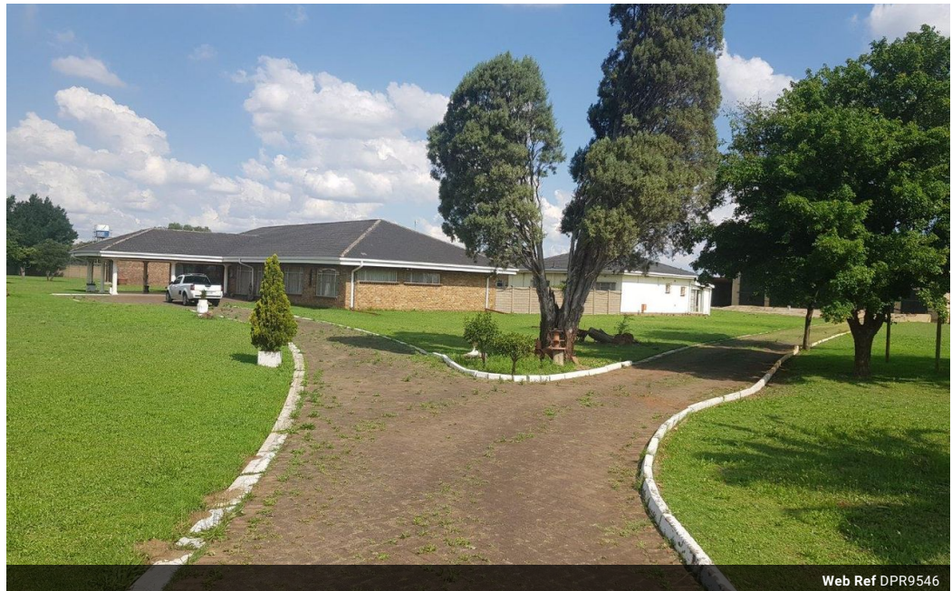
Web Ref DPR9546

24 Glynn Street Rothdene, Meyerton, 1961