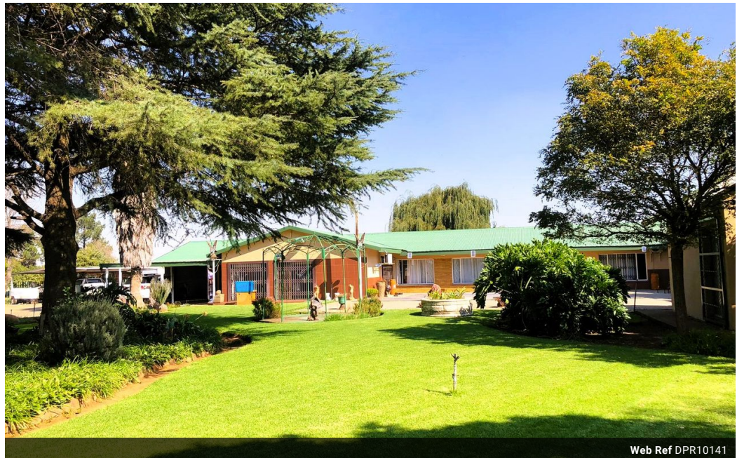
Web Ref DPR10141

24 Glynn Street Rothdene, Meyerton, 1961