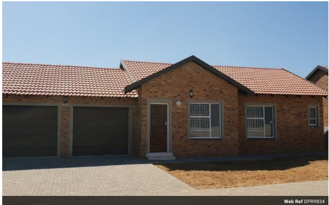
Web Ref DPR9834

24 Glynn Street Rothdene, Meyerton, 1961