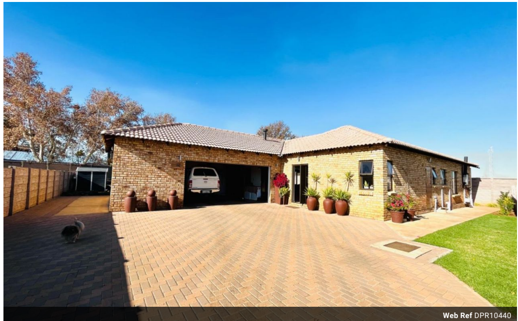
Web Ref DPR10440

24 Glynn Street Rothdene, Meyerton, 1961