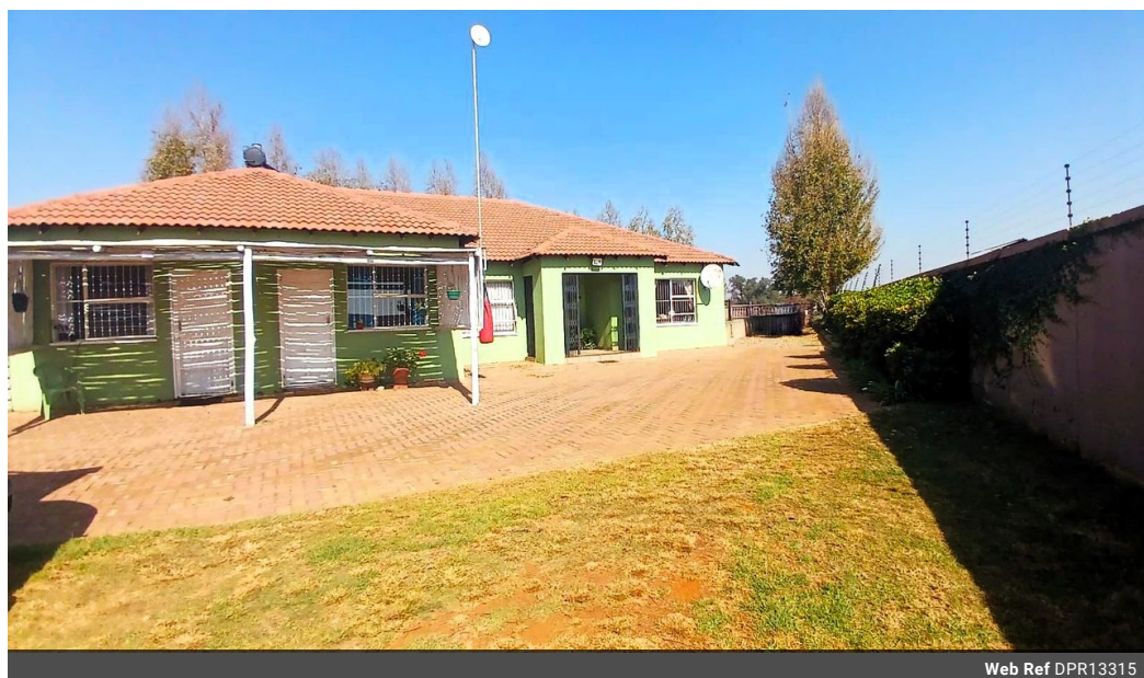
Web Ref DPR13315

24 Glynn Street Rothdene, Meyerton, 1961