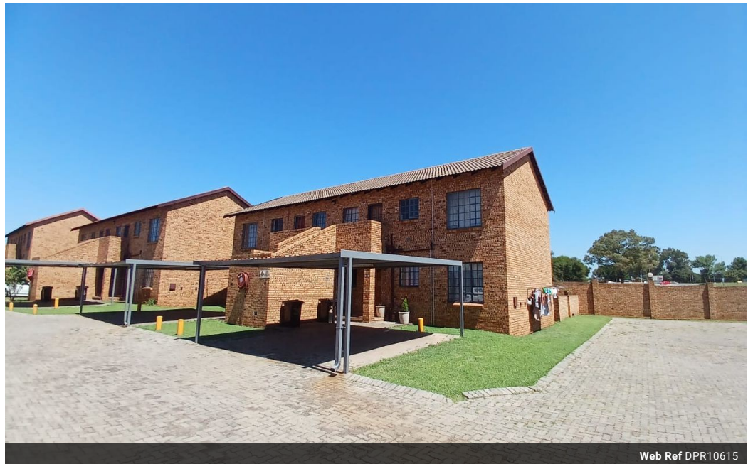
Web Ref DPR10615

24 Glynn Street Rothdene, Meyerton, 1961