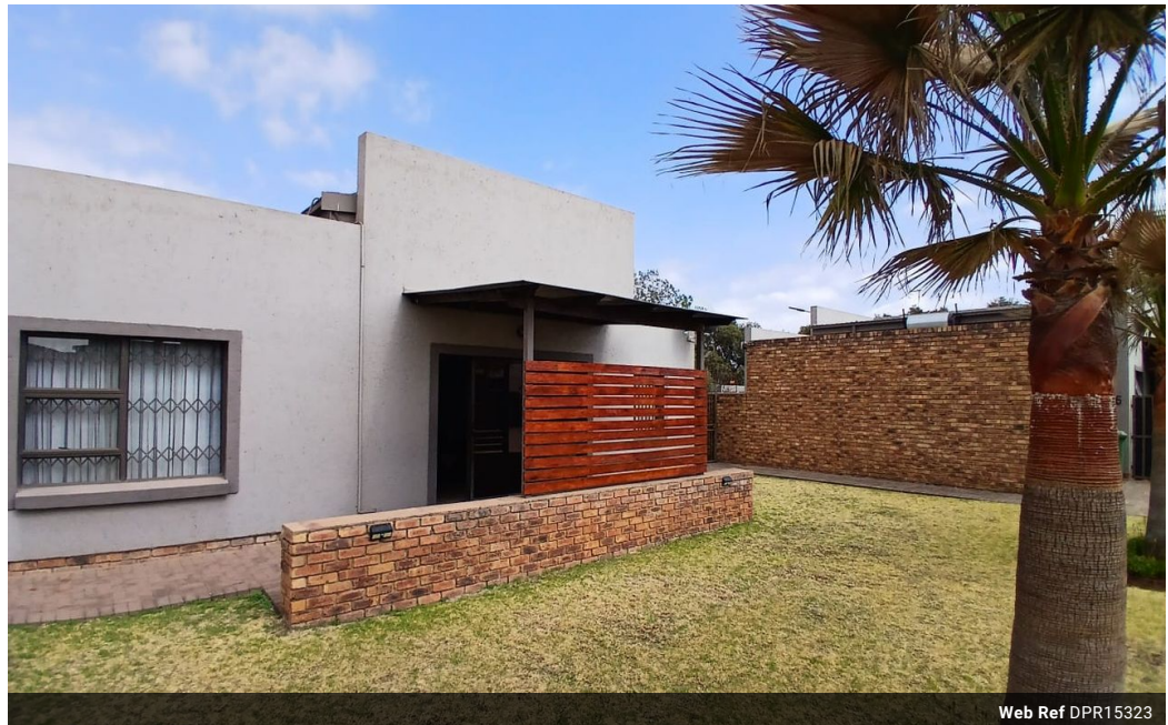
Web Ref DPR15323

24 Glynn Street Rothdene, Meyerton, 1961