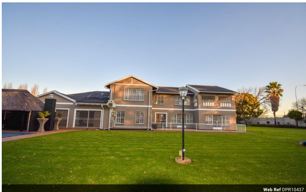
Web Ref DPR10437

24 Glynn Street Rothdene, Meyerton, 1961