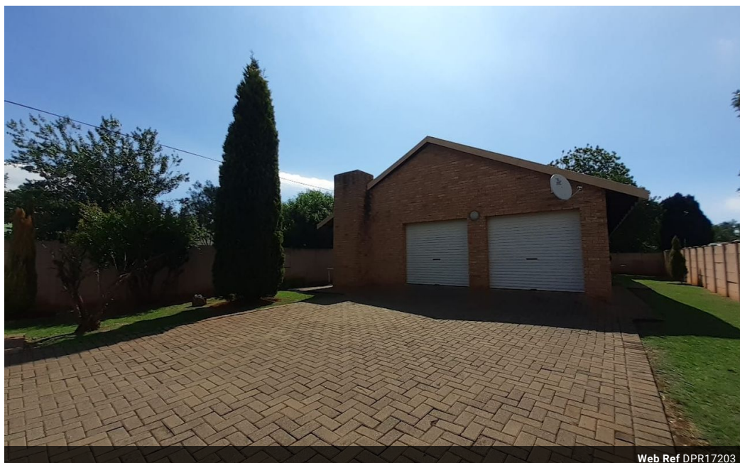
Web Ref DPR17203

24 Glynn Street Rothdene, Meyerton, 1961