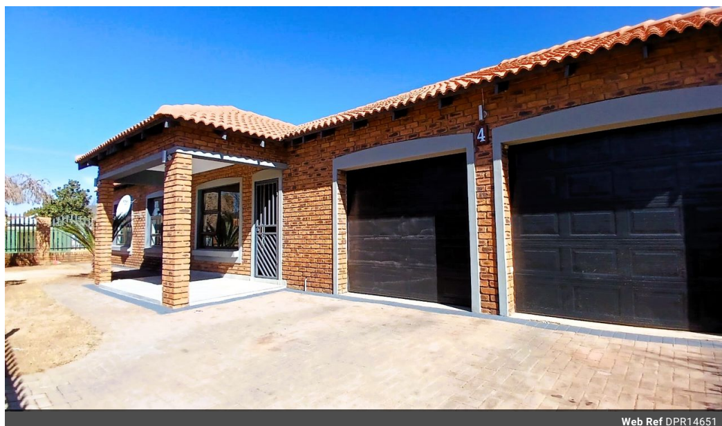
Web Ref DPR14651

24 Glynn Street Rothdene, Meyerton, 1961