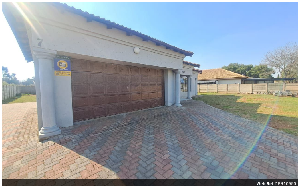
Web Ref DPR10550

24 Glynn Street Rothdene, Meyerton, 1961