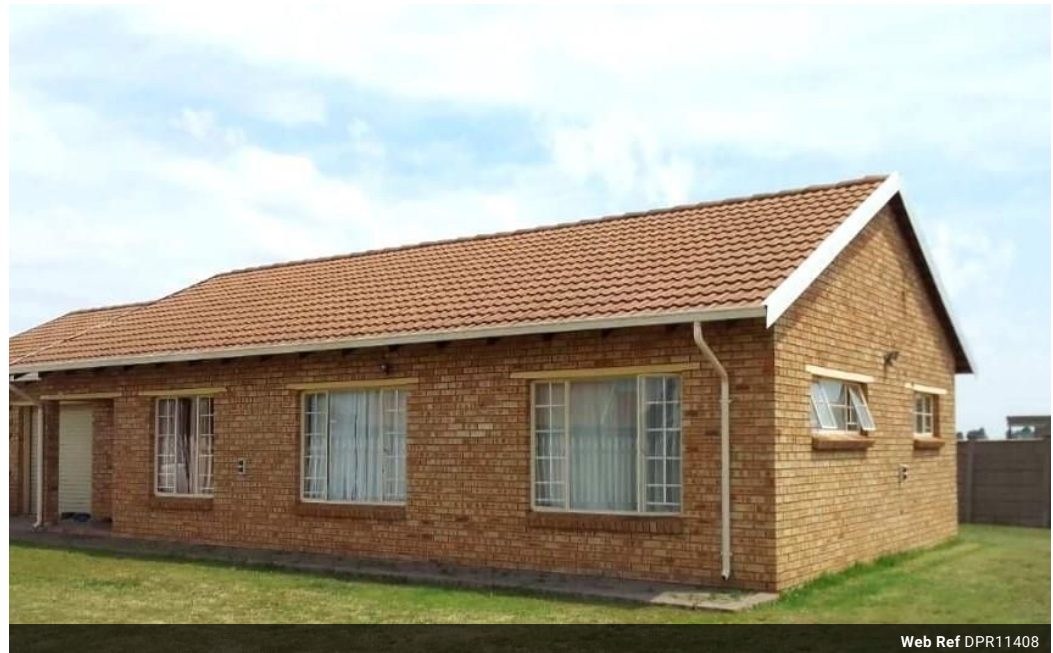
Web Ref DPR11408

24 Glynn Street Rothdene, Meyerton, 1961