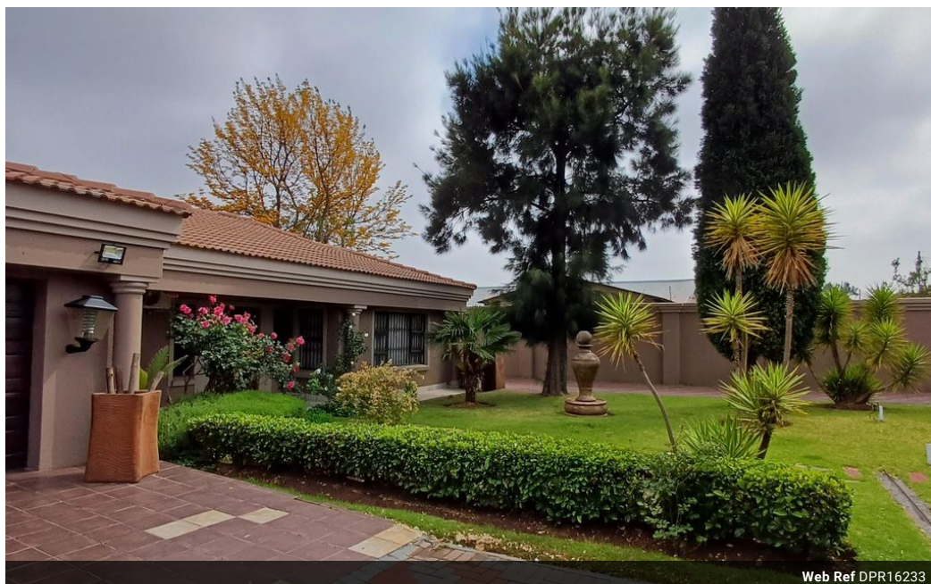
Web Ref DPR16233

24 Glynn Street Rothdene, Meyerton, 1961