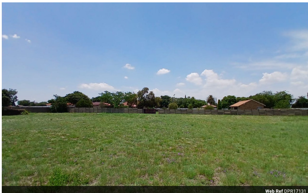
Web Ref DPR17131

24 Glynn Street Rothdene, Meyerton, 1961