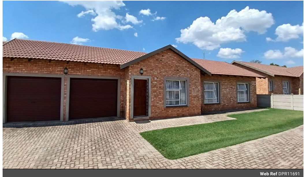
Web Ref DPR11691

24 Glynn Street Rothdene, Meyerton, 1961