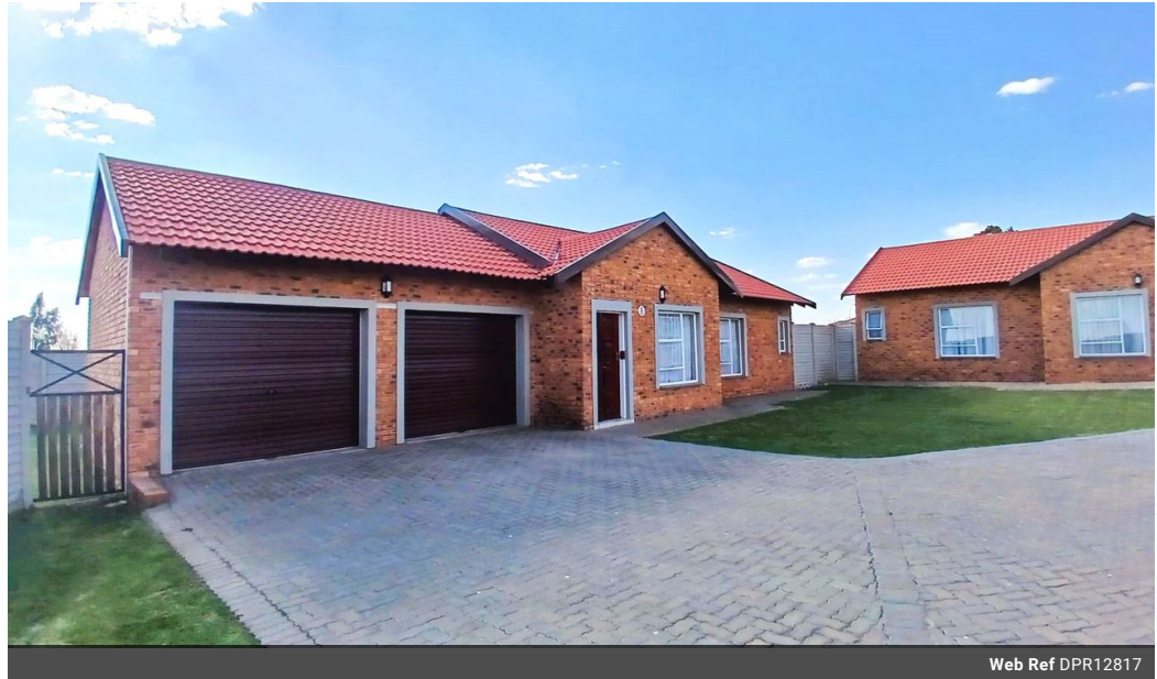
Web Ref DPR12817

24 Glynn Street Rothdene, Meyerton, 1961