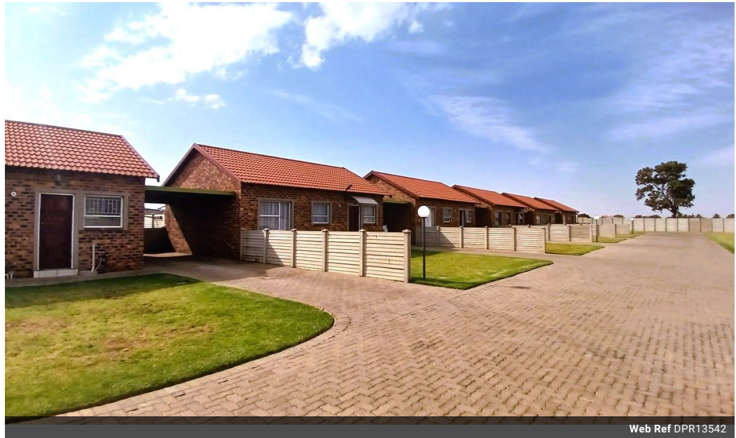
Web Ref DPR13542

24 Glynn Street Rothdene, Meyerton, 1961