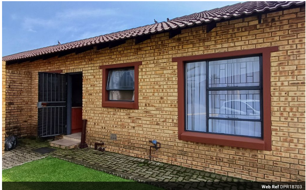
Web Ref DPR18703

24 Glynn Street Rothdene, Meyerton, 1961