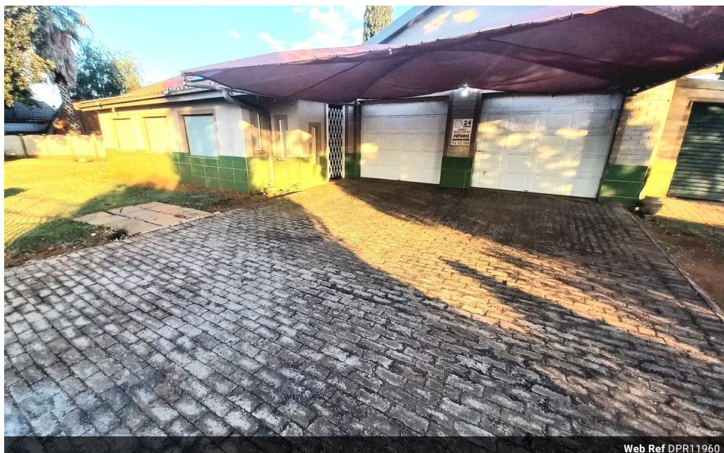
Web Ref DPR11960

24 Glynn Street Rothdene, Meyerton, 1961