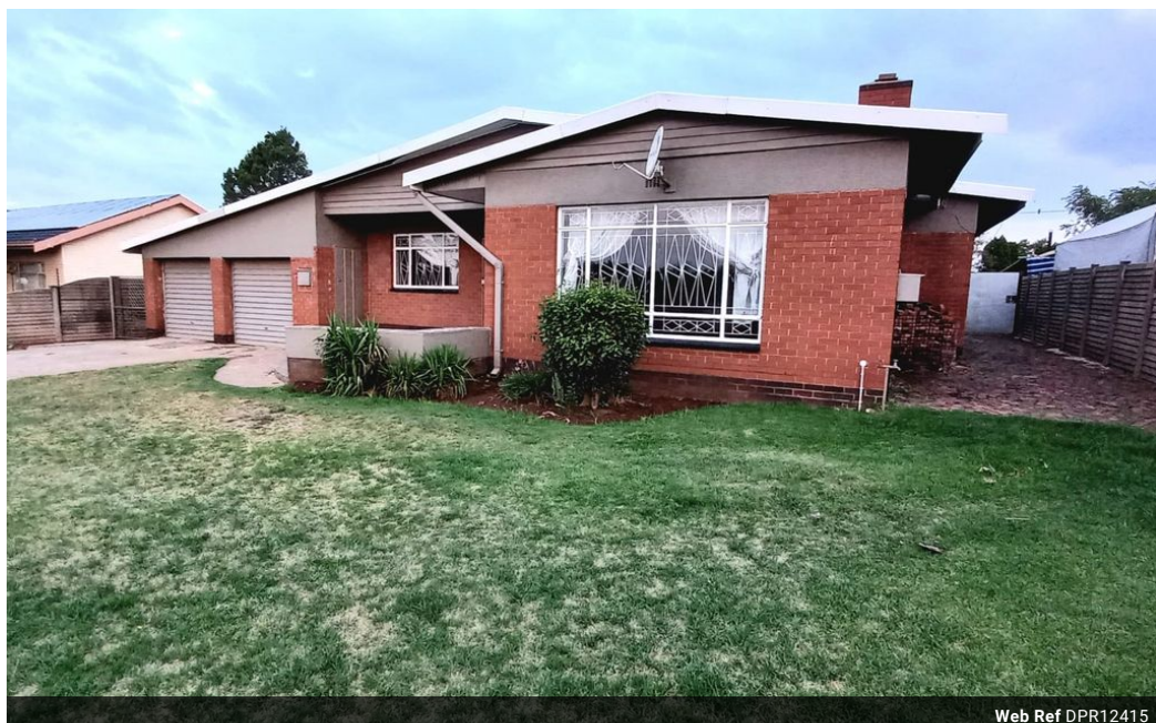
Web Ref DPR12415

24 Glynn Street Rothdene, Meyerton, 1961