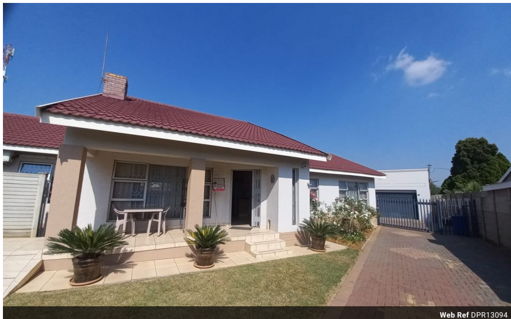
Web Ref DPR13094

24 Glynn Street Rothdene, Meyerton, 1961