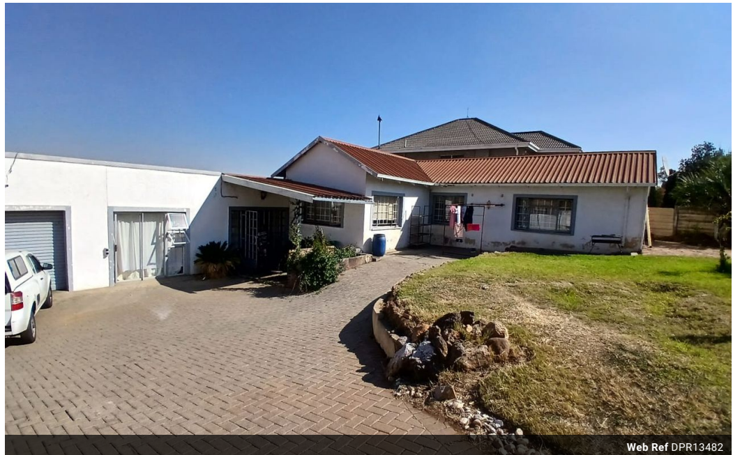
Web Ref DPR13482

24 Glynn Street Rothdene, Meyerton, 1961