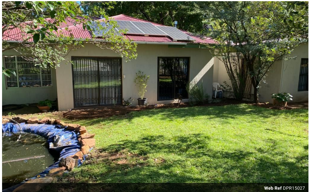
Web Ref DPR15027

24 Glynn Street Rothdene, Meyerton, 1961