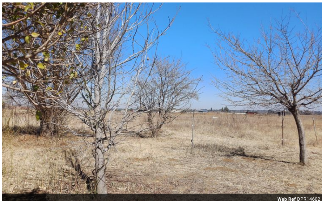
Web Ref DPR14602

24 Glynn Street Rothdene, Meyerton, 1961