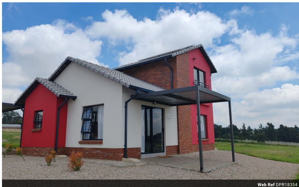
Web Ref DPR18354