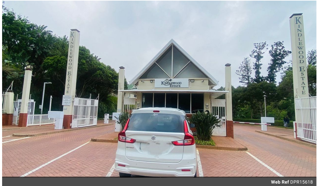
Web Ref DPR15618

558 Mountbatten Drive Reservoir Hills Durban 4090