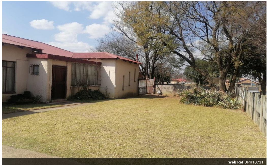
Web Ref DPR10731

18 Klip River Drive Three Rivers Vereeniging