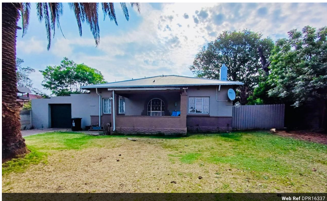
Web Ref DPR16337

18 Klip River Drive Three Rivers Vereeniging