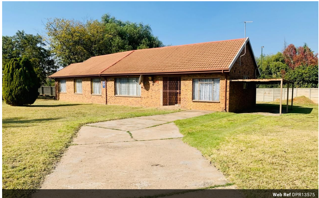
Web Ref DPR13575

18 Klip River Drive Three Rivers Vereeniging