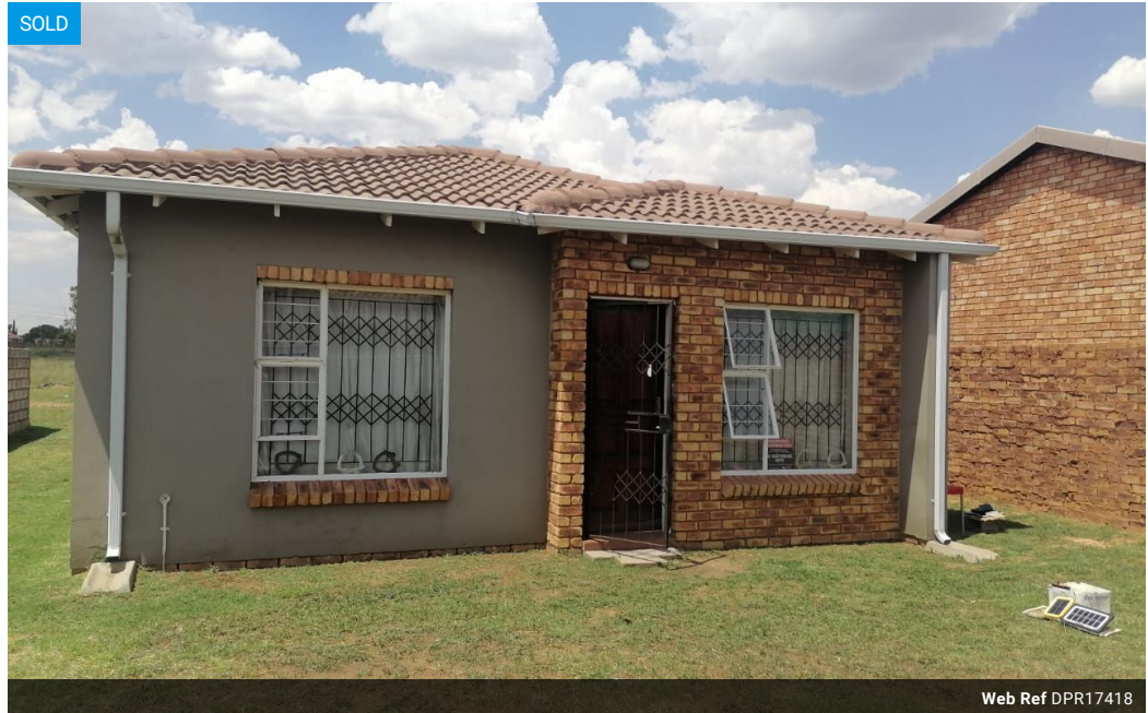
Web Ref DPR17418

18 Klip River Drive Three Rivers Vereeniging