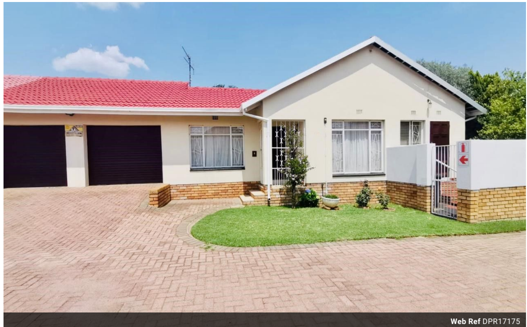
Web Ref DPR17175

18 Klip River Drive Three Rivers Vereeniging