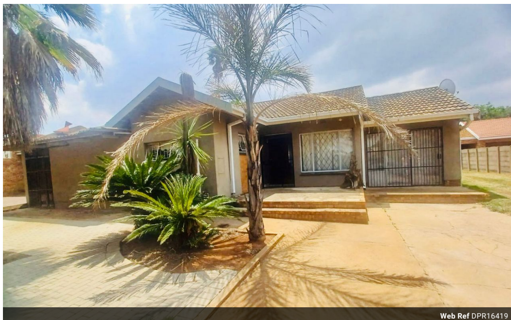
Web Ref DPR16419

18 Klip River Drive Three Rivers Vereeniging