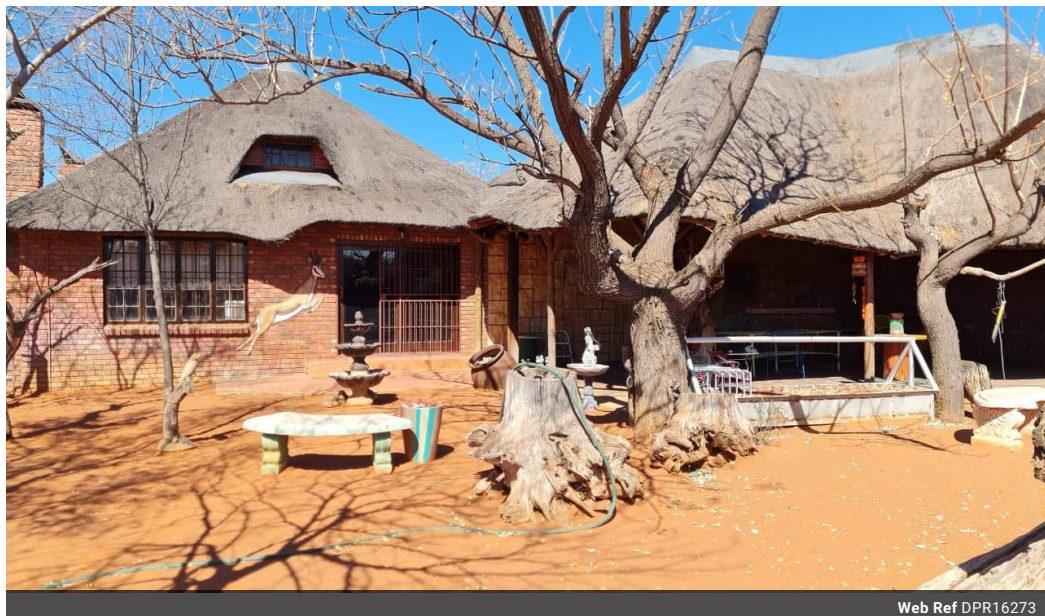
Web Ref DPR16273