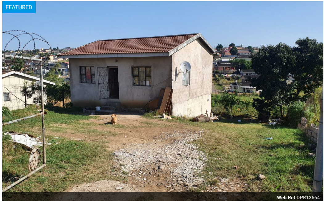
Web Ref DPR13664