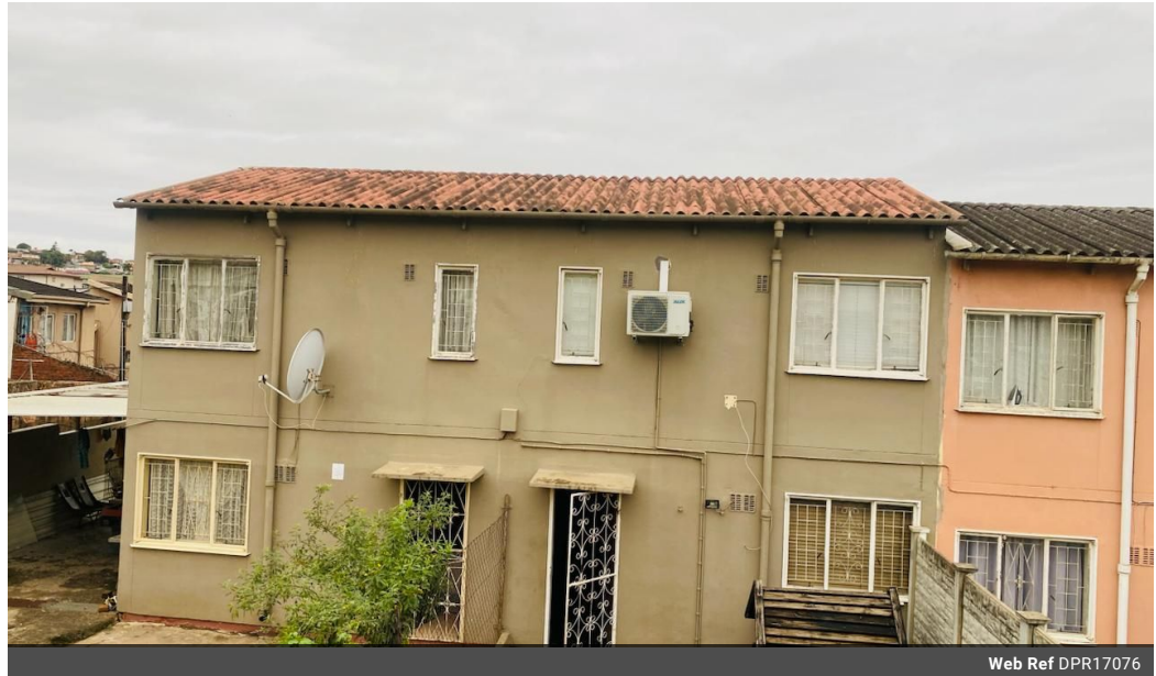
Web Ref DPR17076

558 Mountbatten Drive Reservoir Hills Durban 4090