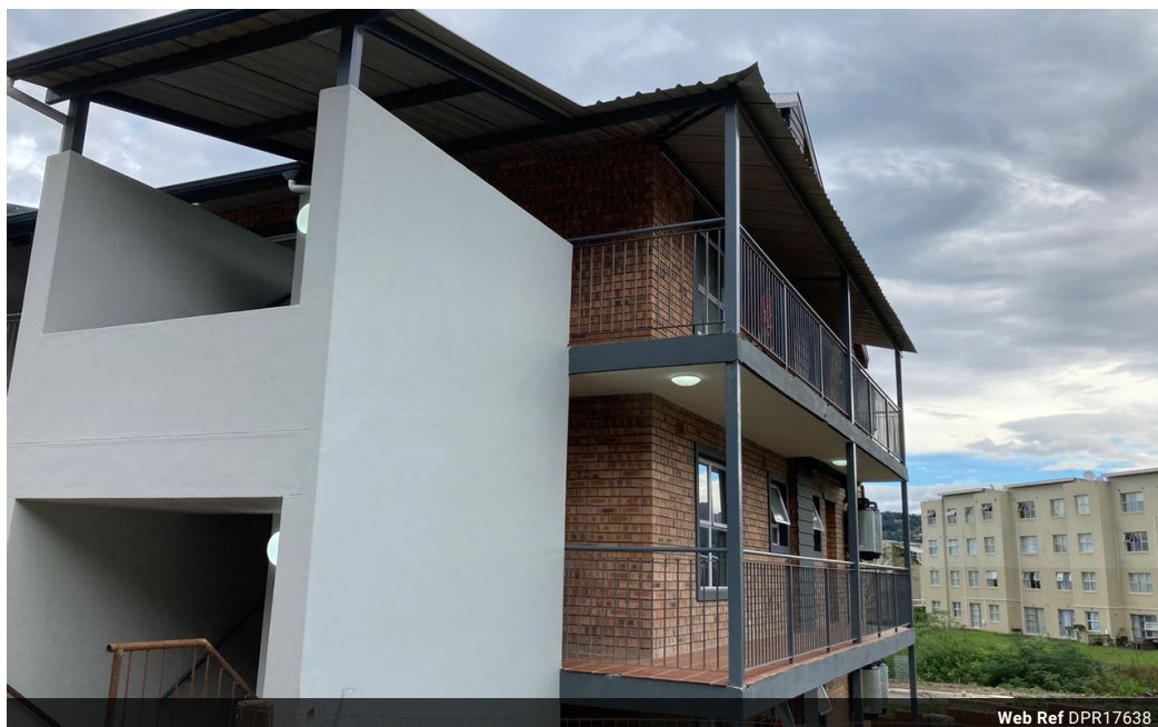
Web Ref DPR17638

Shop 6 Mayors Walk Centre, 86 Mayors Walk, Prestbury, Pietermaritzburg, 3208