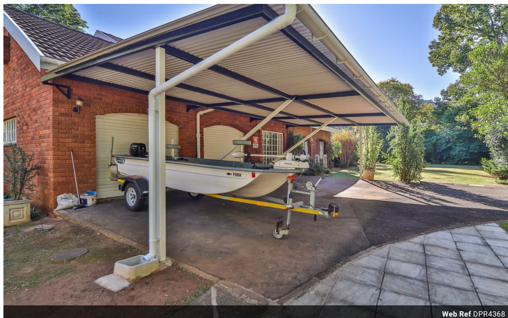
Web Ref DPR4368

Shop 6 Mayors Walk Centre, 86 Mayors Walk, Prestbury, Pietermaritzburg, 3208