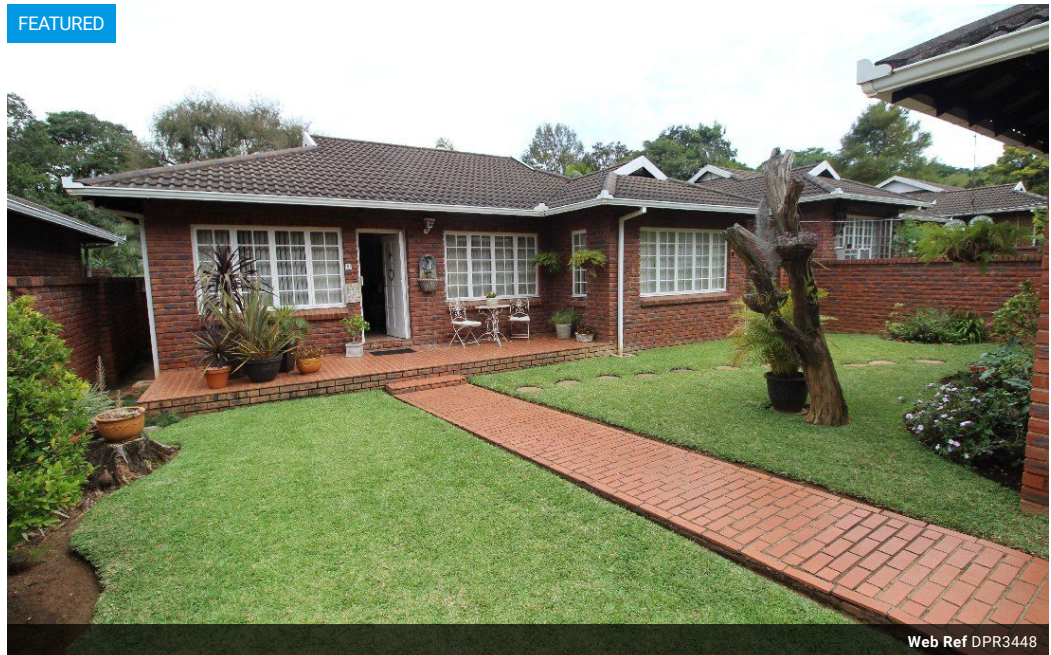
Web Ref DPR3448