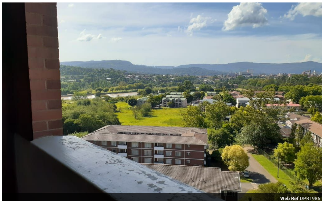
Web Ref DPR1986

Shop 6 Mayors Walk Centre, 86 Mayors Walk, Prestbury, Pietermaritzburg, 3208